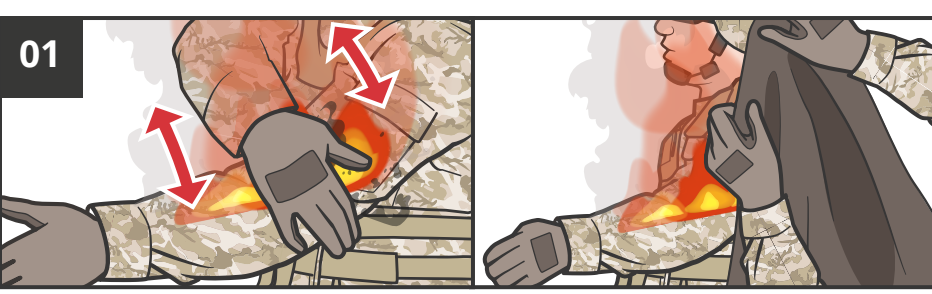
ELIMINATE the source of the burn.

NOTE: All medical interventions can be performed, even if the patient is burned.