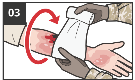
APPLY sterile, dry dressings to burned skin areas.

CAUTION: Do not force clothing off that is stuck to burnt skin.