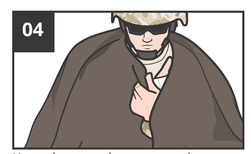
Keep the casualty warm and PREVENT hypothermia.

CAUTION: Do not force clothing off that is stuck to burnt skin.