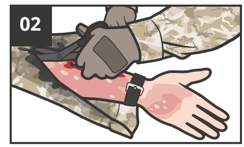
UNCOVER the burn after the casualty has been removed from the source of the burn.