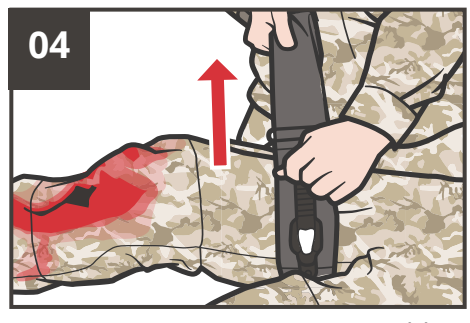
PULL strap as TIGHTLY as possible, removing all excess slack.