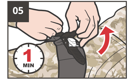
RATCHET maneuver device as tightly as possible until the bleeding has stopped (complete steps 1-5 in under 1 min).