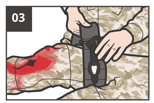
POSITION the tourniquet above the bleeding site, high on the extremity over the clothing/uniform.