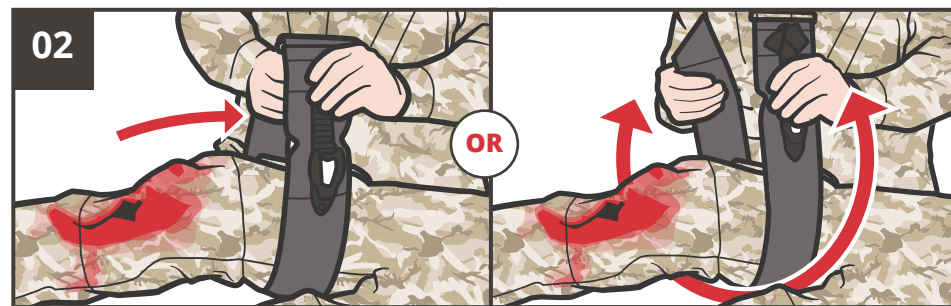
INSERT the wounded limb through the tourniquet strap loop.