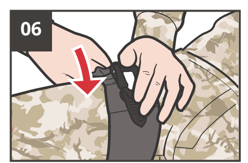
LOCK the ratchet on itself (it will click into place).