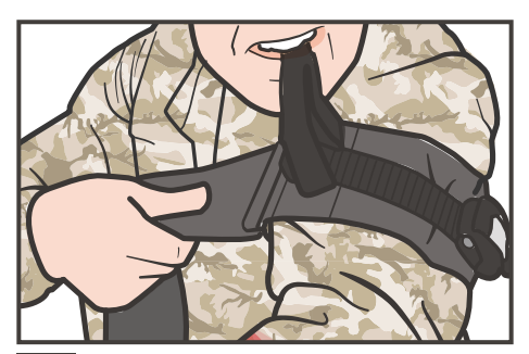
GRASP the tourniquet loop with your teeth (or if able lean against a hard surface) to prevent slipping when tightening.