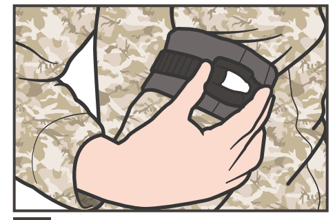
LOCK the ratchet on itself (it will click into place).

NOTE: If bleeding is not controlled, continue to ratchet the maneuver device until bleeding has stopped.