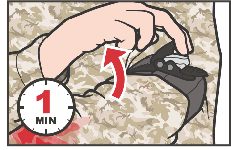
LIFT the lever arm of the ratcheting buckle and tighten by ratcheting the tourniquet until bleeding has stopped (complete steps 1-6 in under 1 min).