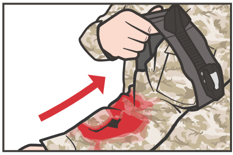
INSERT the wounded 02 extremity through the loop of the tourniquet band.