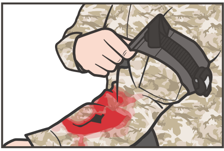
POSITION the tourniquet above the bleeding site, high on the extremity over the clothing/uniform.