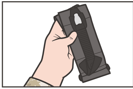
REMOVE tourniquet from the JFAK and/or carrying pouch.