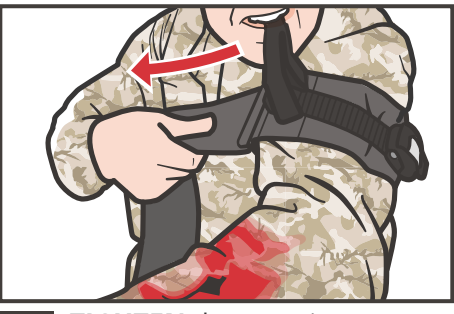
TIGHTEN the tourniquet strap as much as possible.