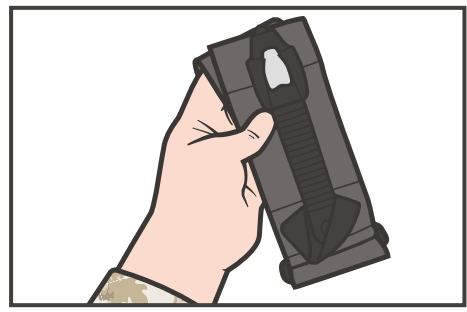
REMOVE tourniquet from the casualty's JFAK and/or carrying pouch.