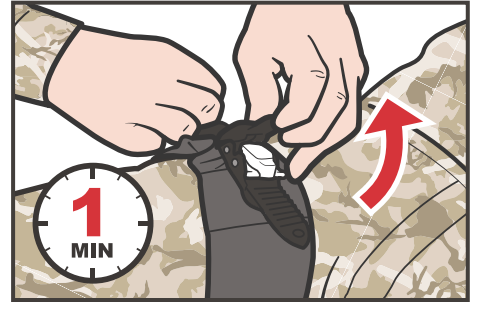
RATCHET maneuver device as tightly as possible until the bleeding has stopped (complete steps 1-5 in under 1 min).