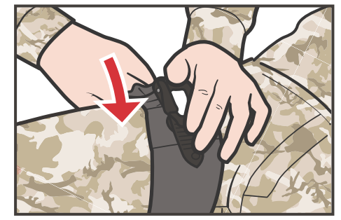
LOCK the ratchet on itself (it will click into place).

NOTE: Do not document tourniquet application time until the Tactical Field Care phase.