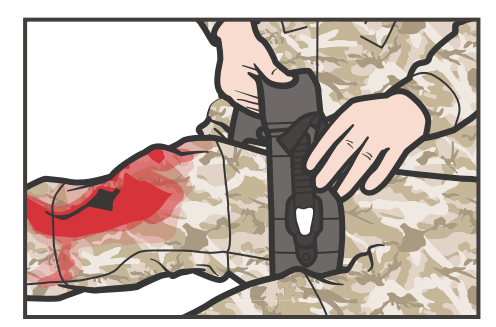
POSITION the tourniquet above the bleeding site, high on the extremity over the clothing/uniform.