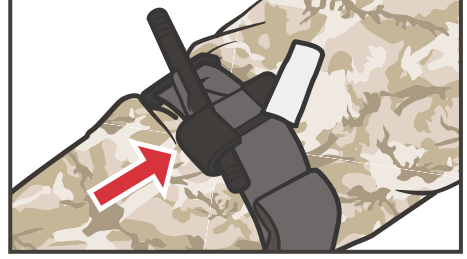
LOCK the windlass rod in place with the windlass clip.