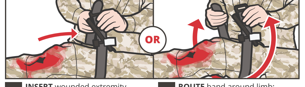
02a INSERT wounded extremity through the loop of the self-adhering band (looped).

02b ROUTE band around limb; pass the tip through the slit of the routing buckle.