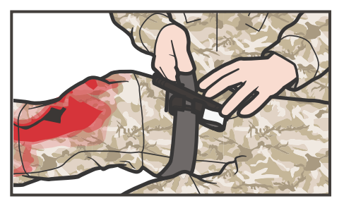
POSITION the tourniquet above the bleeding site, high on the extremity over the clothing/uniform.

02b ROUTE band around limb; pass the tip through the slit of the routing buckle.