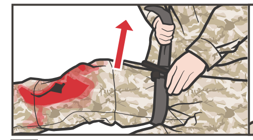
04a ENSURE all the slack in the selfadhering band is pulled through the routing buckle before the band is fastened back on itself and the windlass is twisted.