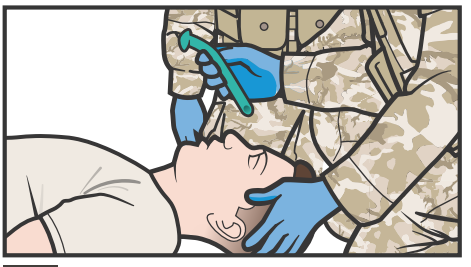
02 INSERT a nasopharyngeal airway.

POSITION yourself at the top of the casualty's head, and your partner to the side of the casualty's head.