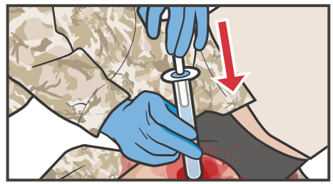
1NSERT the plunger into the device if using the XSTAT 12.