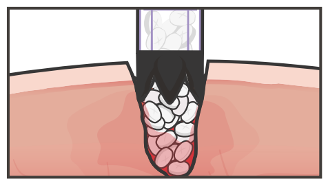
PACK the wound with mini-sponges, using additional applicators as needed.

NOTE: Do not attempt to forcefully eject the material from the applicator.