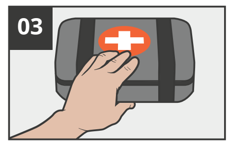
RETRIEVE first aid kit