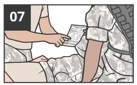
COMMUNICATE with medical personnel any aid provided

ALL SERVICE MEMBERS TACTICAL COMBAT CASUALTY CARE LIFESAVING SKILLS