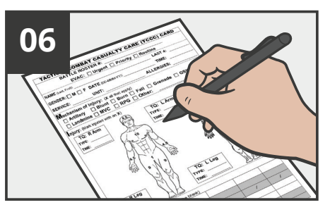
DOCUMENT medical aid on a DD1380 TCCC Card