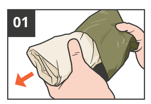
REMOVE the bandage from the pouch and packaging