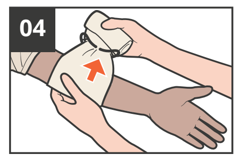
INSERT the elastic bandage into the pressure bar