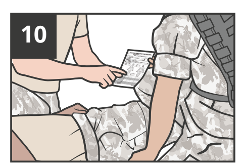
COMMUNICATE with medical personnel any aid provided

ALL SERVICE MEMBERS TACTICAL COMBAT CASUALTY CARE