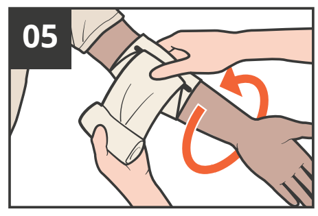
REVERSE WRAP the elastic bandage back over the top of the pressure bar