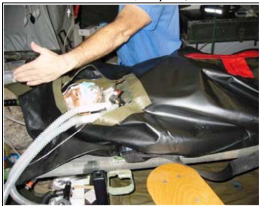
Hot Pocket (complete)