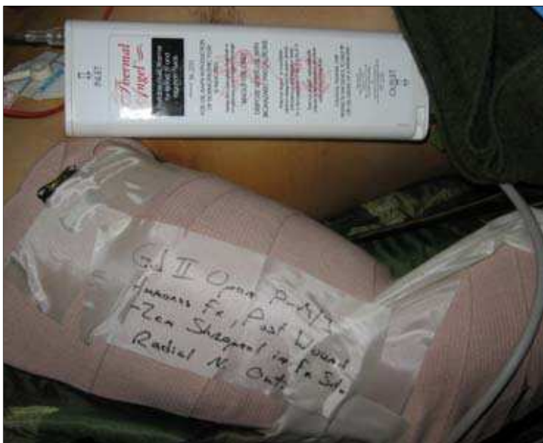
Figure 5, Thermal Angel