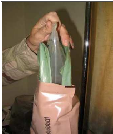
Warming IV Fluids w/ MRE Heaters