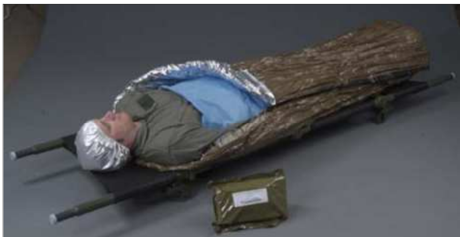
Figure 2, Ready-Heat Blanket, Blizzard Rescue Blanket, and Thermo Cap