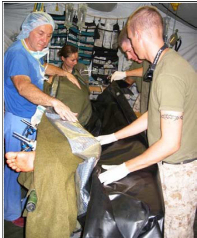
Hot Pocket (wool blanket, space blanket and body bag)