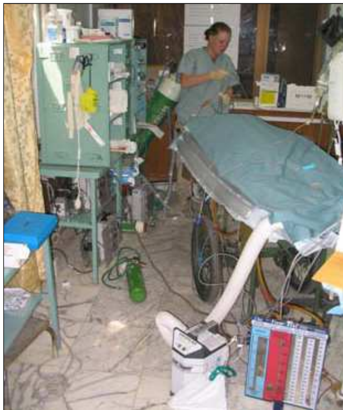
Figure 3, Bair Hugger and Thermal Angel

Guideline Only/Not a Substitute for Clinical Judgment