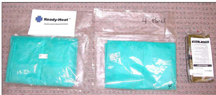
Figure 7, Vendor Packed "Ready-Heat" Blanket

Guideline Only/Not a Substitute for Clinical Judgment