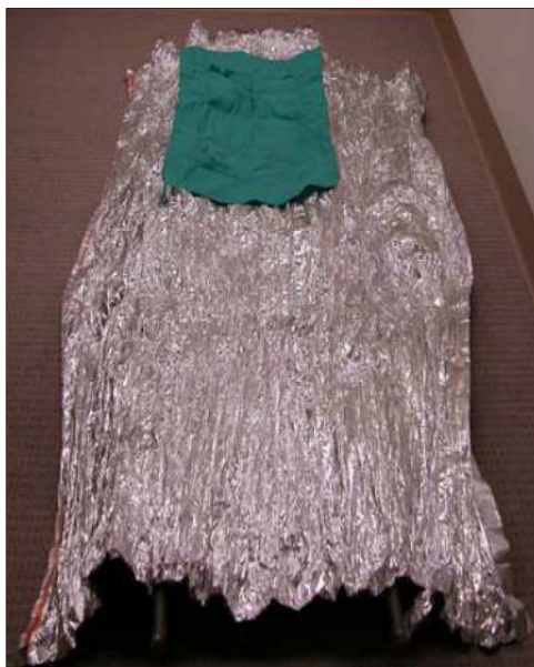
Figure 1, Blizzard Blanket